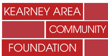
The Foundation's original logo