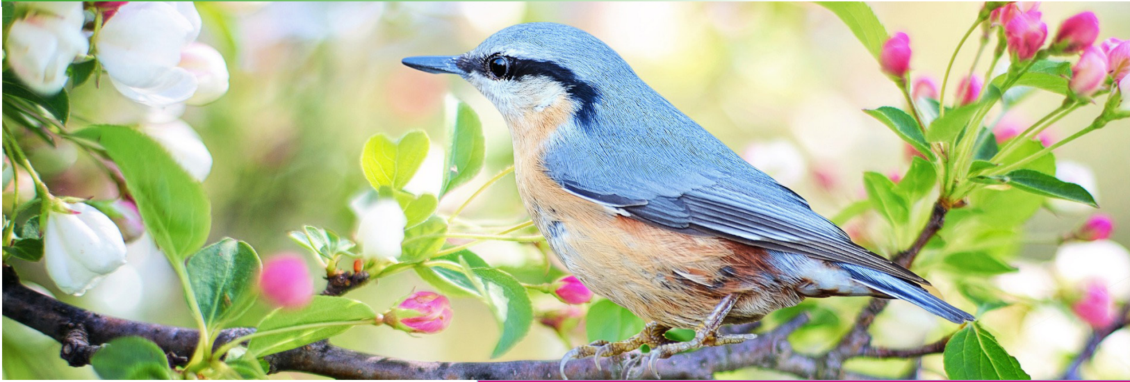
“connecting people who care with causes that matter”