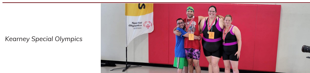
Kearney Special Olympics