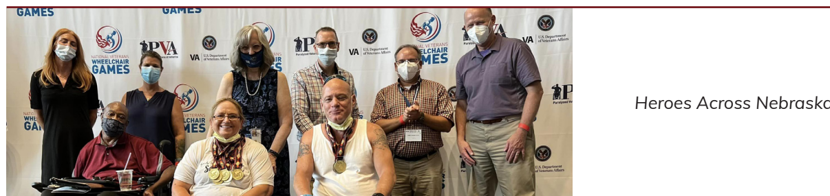
Heroes Across Nebraska